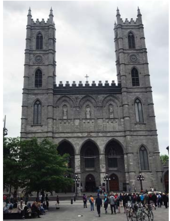
Notre-Dame Basilica of Montreal, Canada.