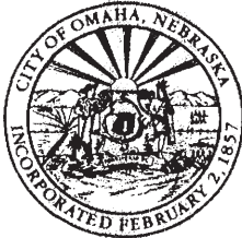
City of Omaha Mike Fahey, Mayor

Office of the Mayor 1819 Farnam Street, Suite 300 Omaha, Nebraska 68183-0300 (402) 444-5000 FAX: (402) 444-6059