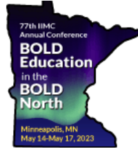
2023 IIMC Conference