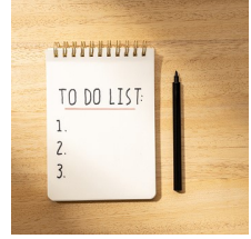
Birthdays Municipal Legal Calendar