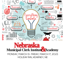
NMCA Institute & Academy or Clerk School