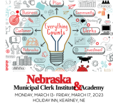
NMCA Institute & Academy or Clerk School